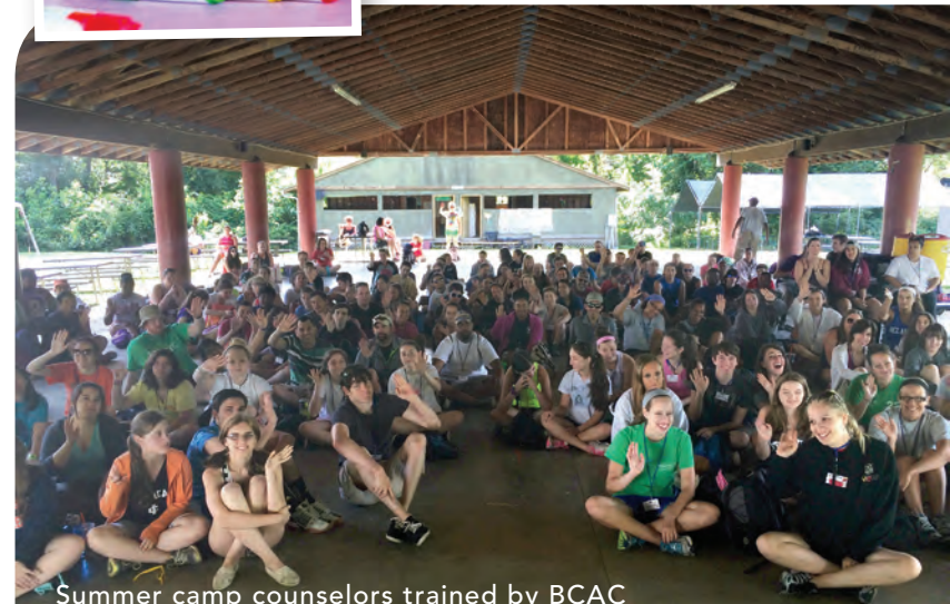
Summer camp counselors trained by BCAC staff on how to keep kids safe.